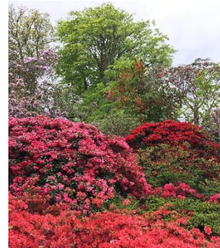
Banks of Rhododendron